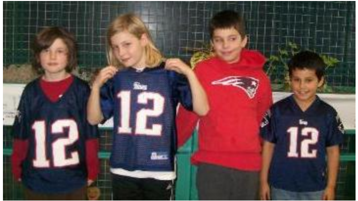
Patriotic Healey fans now have a brand new season

The Healey School raised $1500 for Pennies for Peace in spring 2011.